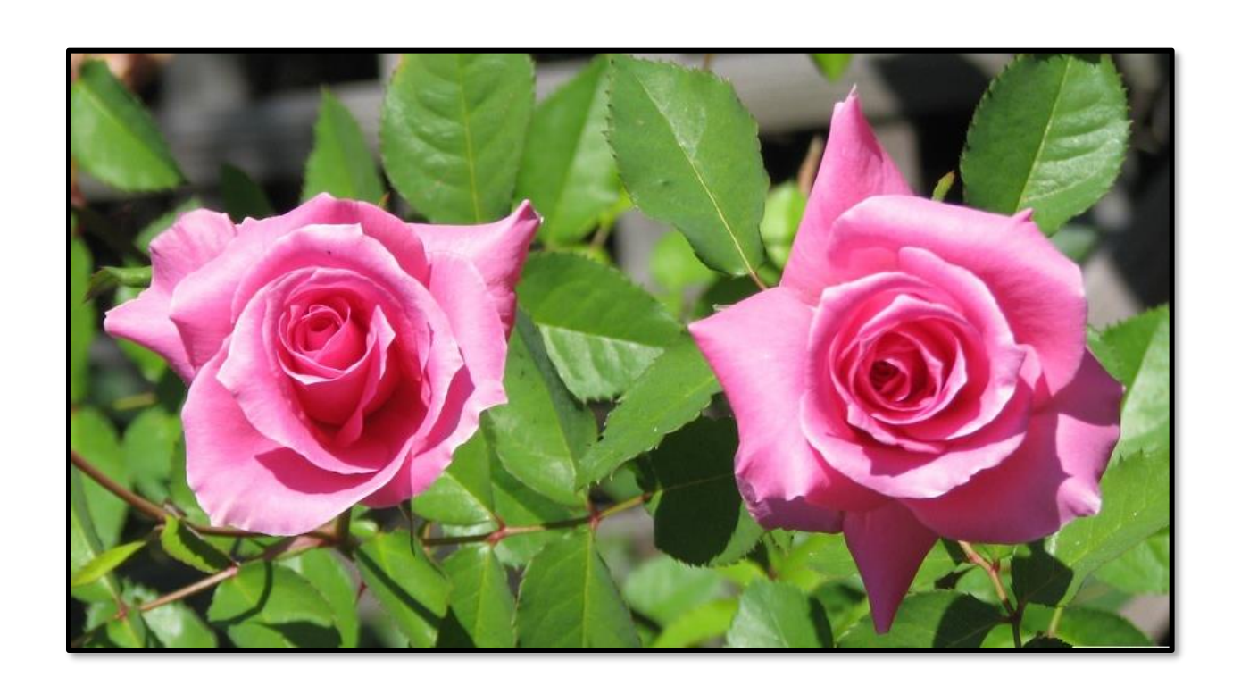
'Naga Belle' An outstanding variety out of 'Carefree Beauty' bred by Viru Viraraghavan