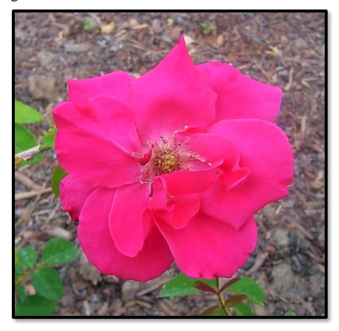
'Piccolo Pete'