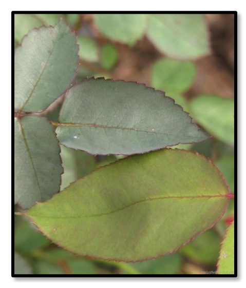
f1 'Prairie Flower' foliage on top

Lastly, is 'Maytime.' This single-flowered