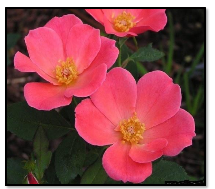
'Summer Wind

rose resulted from a cross of the yellow Brownell climber 'Elegance' and the vigorous pink 'Prairie Princess,' a Buck rose released in the late 60's. The blooms of 'Maytime' are various shades of pink with a pale yellow center giving the overall impression of apricot. It was reported by California rose breeder Dr. Walter Lammerts to be immune to powdery mildew. The rose I have in my garden labeled 'Maytime' does not appear to match the color description and raises concerns that what is in commerce at present may be mislabeled. The cultivar that I have (see below) produced a red-flowered sport in 1982 (in the gardens of Roses Unlimited) that was registered and named 'Brave Patriot.'