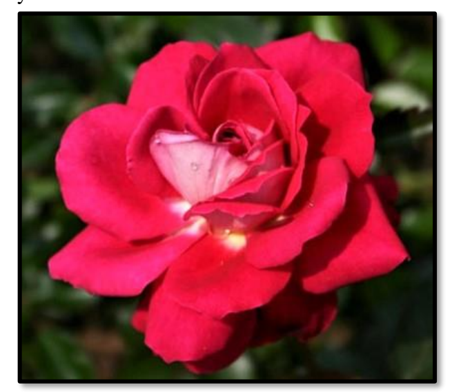
'El Catalá'

With a goal of producing garden roses that would retain their foliage long into the growing season and survive Iowa's harsh winters (to -20°F/-29°C), over one-hundred Buck hybrids were bred and named. Because he often gave them away to friends many failed to gain wide U.S. distribution. After his death a concerted effort was made by the Buck family to get them into commerce and many gained wider recognition. Indeed, with the 21<sup>st</sup> century interest in "lower input" rose gardening, many have become deservedly more popular. Although the majority have beautifully double blooms, there is a fascinating group with single, nearly single, or semi-double flowers that deserve wider recognition!