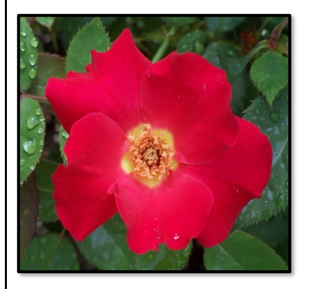
Teft: 'Brave Patriot'