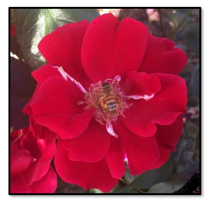
'Prairie Clogger'

Sister seedlings 'Bucred' (aka "Red Dream") and 'Prairie Clogger' were bred in 1977 but not released until 1984. 'Carefree Beauty' was the seed parent, and a cross of a Kordes Floribunda, 'Marlena,' with a now lost Buck variety 'Pippa's Song,' provided the pollen. 'Bucred' is a loose semi-double rose with bright red flowers and is reported to have fewer prickles than its sister seedling. According to the previously mentioned study, it was among the top five landscape performers among the thirty-eight Buck roses tested in north-central Texas. 'Prairie Clogger,' also red, is single-flowered, extremely floriferous, and more fragrant. It is a good example of Dr. Buck's effort to use names associated with life in the midwestern United States.