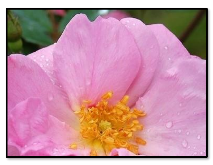
Closeup of stippling

morning. It was perfect weather for the release of foliage fragrance from sweetbriar roses. I noticed that the foliage of one particular seedling was very apple scented. It just so happened that this seedling was also in full bloom at the time and the combination of the clove scent of the flowers and apple scent of the foliage proved too much for me. It was so overwhelming that it drove me out of the garden." Because of its apple-scented foliage Dr. Buck originally wanted to name it "Summer Pippin" after a popular heirloom apple variety, but that name was considered unacceptable. Via one of its descendants, 'Carefree Beauty,' it can be found in a number of his introductions as well as those of other breeders.