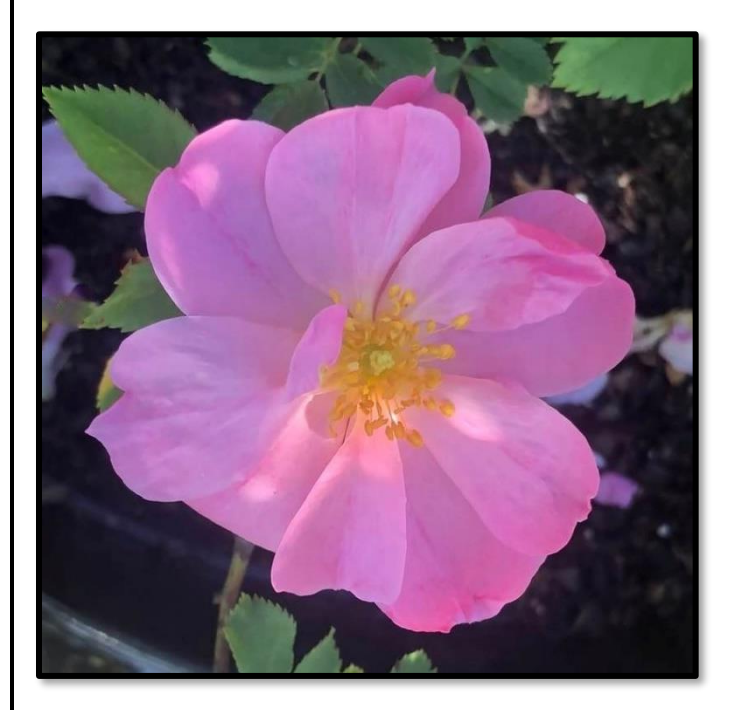
'Applejack'

Applejack is considered "America's Native Spirit." The Laird family began distilling it in 1678 in Monmouth, NJ. It was a drink popular with several US presidents including George Washington. Early nicknames for the spirit were: Jersey Lightning, Corpse Revivor, Essence of Lockjaw, and Horn of Gunpowder!