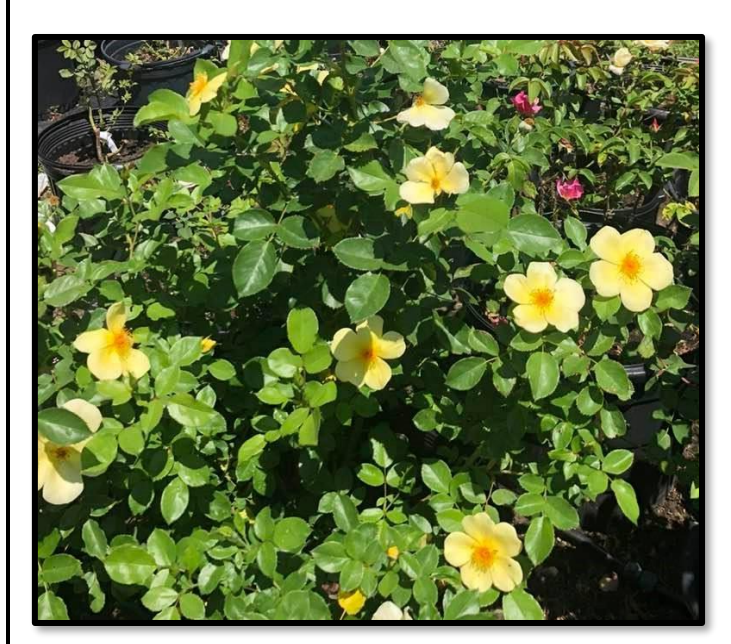
Upper Right: 'Tottering-By-Gently'

any spray in my Georgia garden. Although it is selfcleaning, tolerance to black spot in high pressure regions will likely be improved by regular dead-heading. 'Tottering-By-Gently' has grown larger than other yellow favorites 'Lemon Fizz,' 'Carefree Sunshine,' and 'Limoncello' in my garden and it produces a nice crop of orange-red hips if allowed. Plant this variety and you may discover gold in your garden!