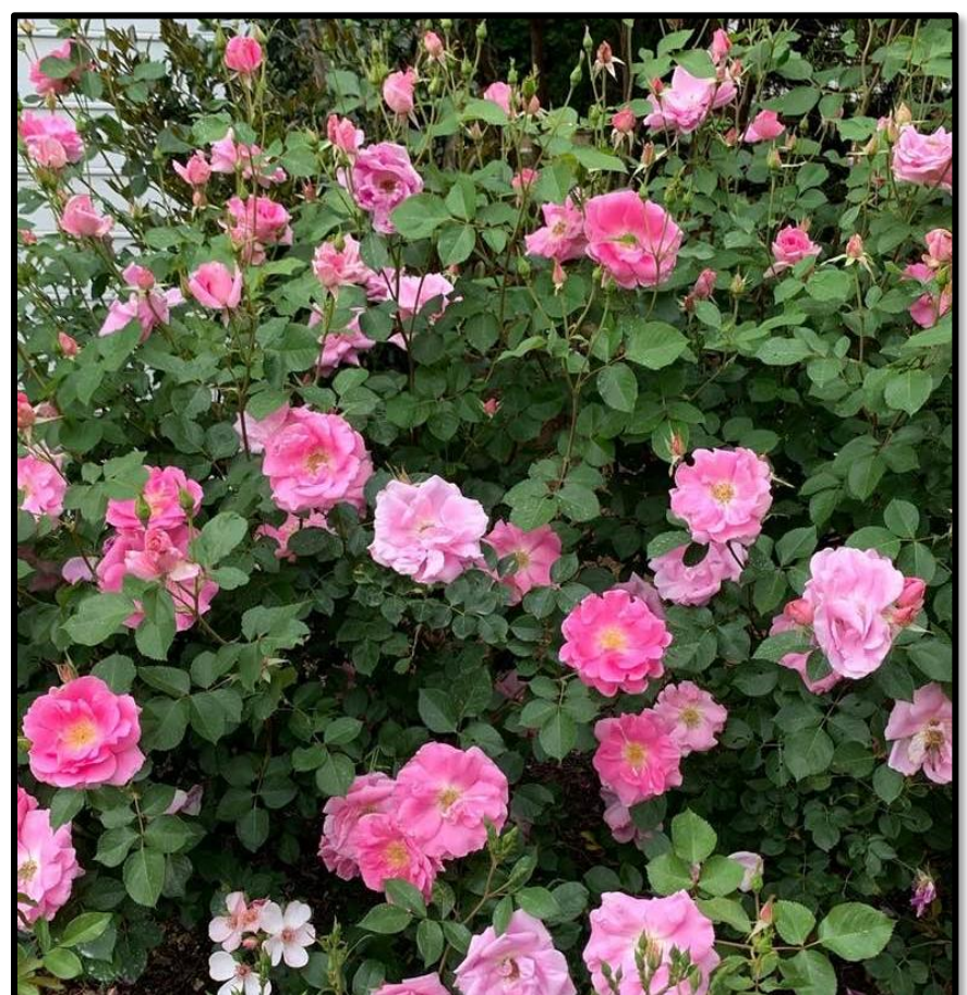
'Carefree Beauty'