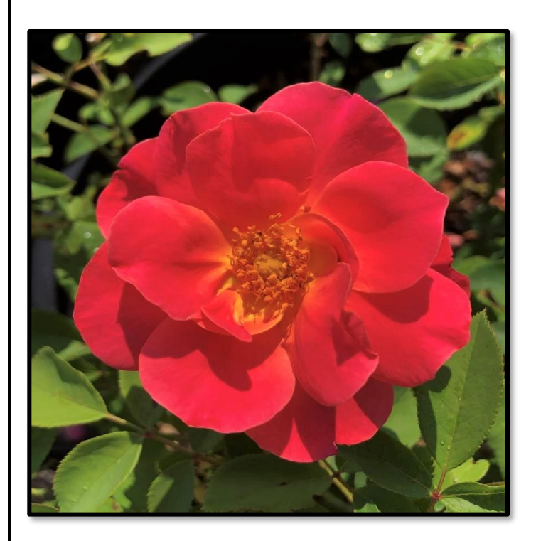
'Coral Miracle'

In 2021 two new roses, 'Pink Miracle' and 'Coral Miracle,' were released by Certified Roses. 'Pink Miracle' is a ten petaled hot pink cultivar. The filaments arise from a dark red base, a feature that I find quite appealing. Several characteristics distinguish it from other single-flowered pink floribundas and shrubs - no fade and no white eye. In its first year in my garden the blooms generally arrived one per stem and had a slightly more upright habit of growth than 'Coral Miracle' or 'Miracle On The Hudson.' The dark green semi-glossy foliage is very black spot resistant; maroon tinted new growth provides an attractive foil to the neon colored blooms.