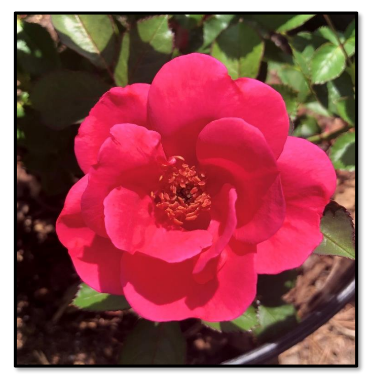
'Pink Miracle' - Photo by Stephen Hoy

'Coral Miracle's petals are a uniquely colored pastel coral-orange on the surface contrasted by a lighter reverse. Golden yellow stamens brighten the blooms up even further. Most blooms generally have at least fifteen petals and arrive both one-per-stem and in small clusters. One reviewer states that it has a more pronounced fragrance than the other "Miracles," although that feature has escaped my notice. The matt foliage is olive green and has been quite black spot resistant in my long Georgia growing season. 'Coral Miracle' has a bushy habit, much like 'Miracle On The Hudson.'