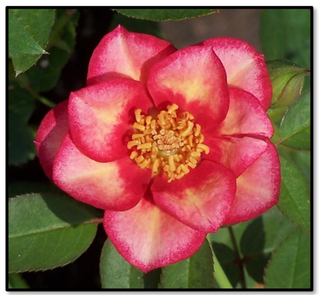
Upper Right: 'Halo Sweetie'

'Halo Glory' was released in 2003. He used a seedling out of 'Gold Badge' x Eyelav as the seed parent and either an unknown or unregistered pollen parent. Its coloring made it one of my favorites among the Halo offerings. The petals are a blend of pinks growing paler toward the center with darker rose-red edges. The glowing red halo and yellow stamens set the blooms ablaze!