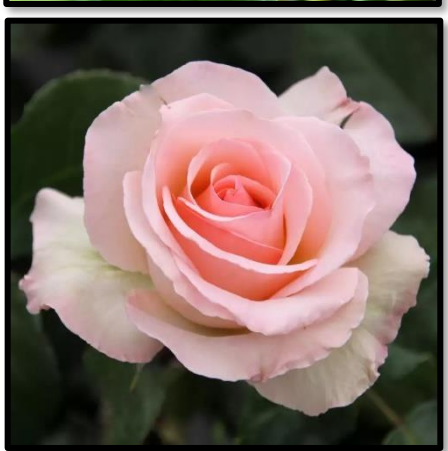
Teft: 'Frederyk Chopin' 19<sup>th</sup> Century Polish Composer Bred by Stanislaw Zyla