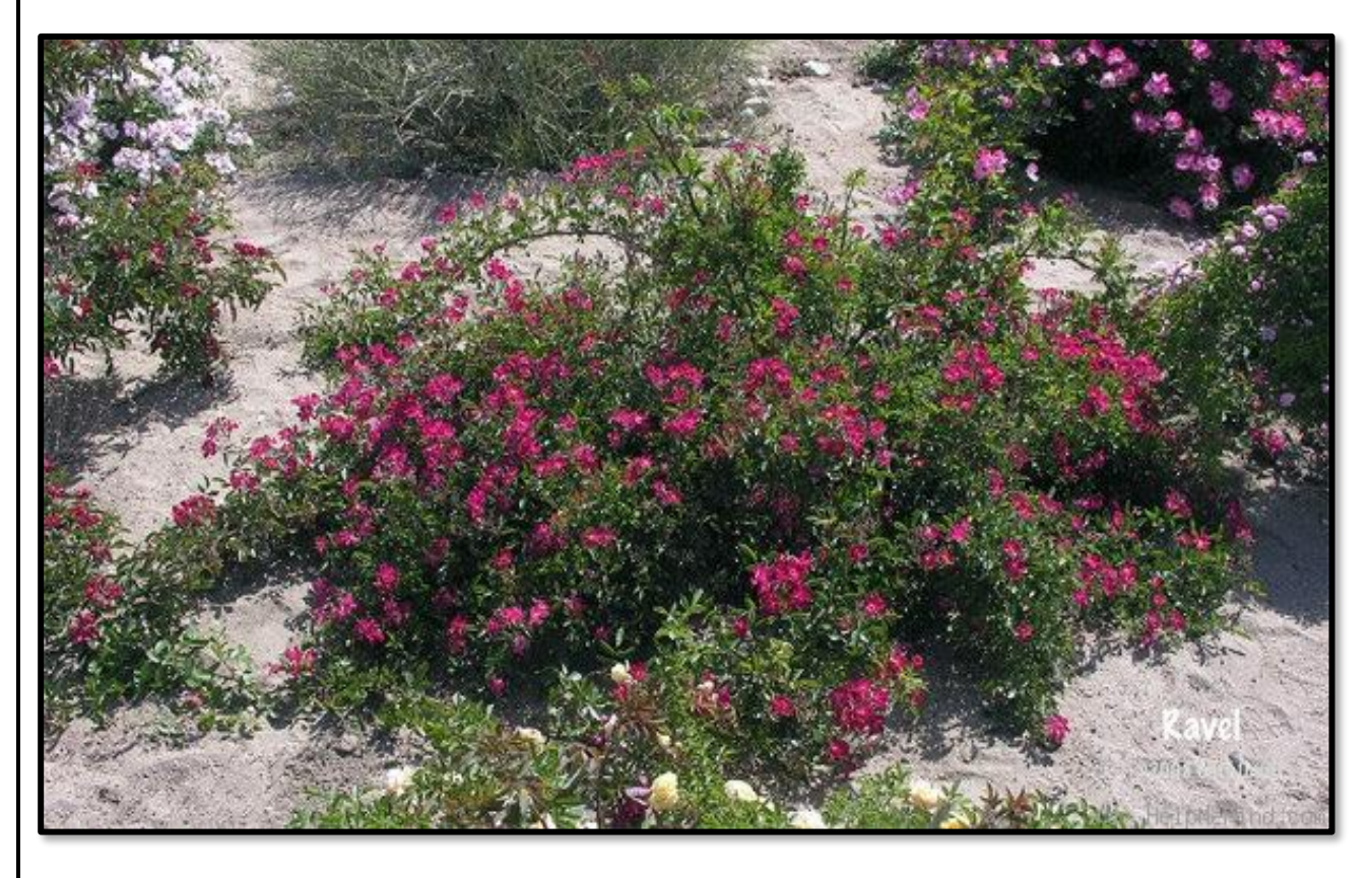
Above: 'Ravel' - Photo by Cliff Orent