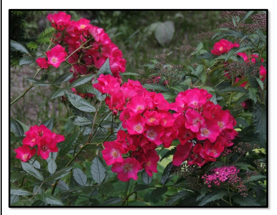
'Paganini'

beautiful Pavanne pour une enfant dèfunte , opera, solo piano works, and two ballets. He was also well-known for having orchestrated Mussorgsky's Pictures at an Exhibition. Bolero , his last composition, was premiered in 1928. For us trombonists, it has one of most exposed and challenging solos in the orchestra literature. <a href="https://www.google.com/search?tbm=vid&sxsrf=ALiCzsYuxU5qqzec28ddwwU1QGSKhP36Gg:1672165551317&q=Trombone+solo+from+Bolero&sa=X&ved=2ahUKEwi hcSNtpr8AhUhlmoFHQRgAX8Q8ccDegQIDBAH&biw=1280&bih=609&dpr=1.5-fpstate=ive&vld=cid:78324d5a,vid:eVbKG MNEII</a>