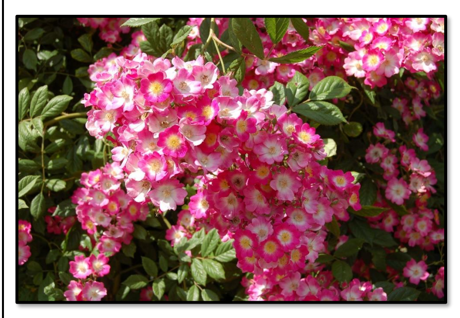
'Mozart' - Photo unattributed

Numerous roses have been named to honor musicians that dedicated their lives, often to the point of struggling with poverty, to composing music. Enjoy the following concert!