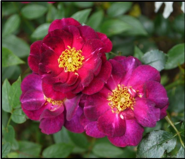
'Blue Peter' – Miniature, 1983, De Ruiter