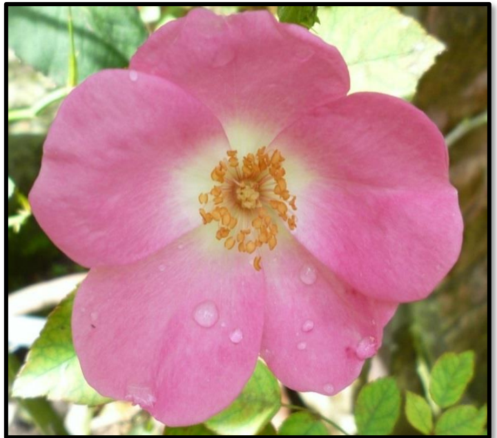
'Rose Legend' (Akira Ogawa) – the first recurrent seedling out of a new Japanese R. laevigata sport; pink to lilac; Photo by Viru Viraraghaven