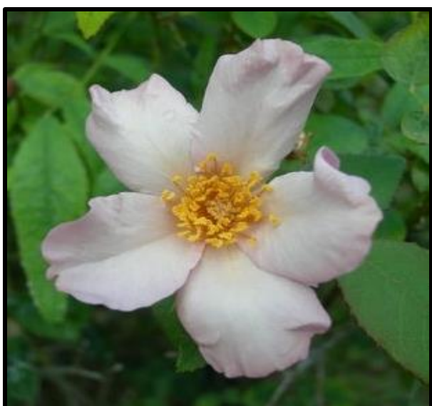
Upper left: 'Lilac Charm' – Floribunda, 1962