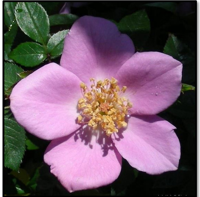
'Lavender Spoon' – Miniature bred from rose at left, 1995