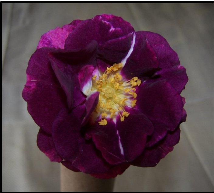
'Rpeacock' – an unreleased seedling out of 'Rhapsody in Blue'

Where to end? Hopefully the story continues . . .