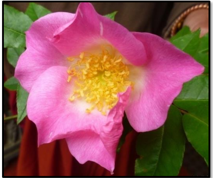
'Mia Grondahl' – Hyb. Gigantea, < 2014